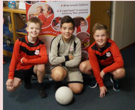
Thanks to the Friends of Florendine we now have a super new football kit.

Friday 28 th - Wellbeing "Feel good Friday "