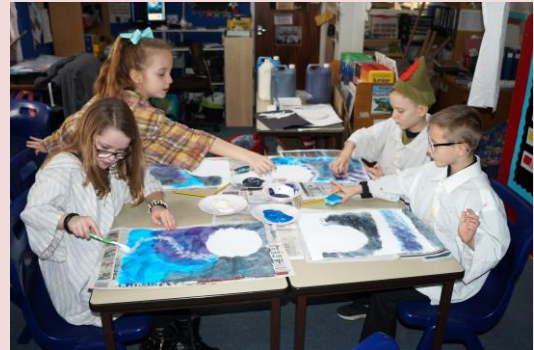
Getting creative in Neverdine.

Friday 28 th - Wellbeing “Feel good Friday “