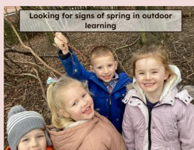
Looking for signs of spring in outdoor learning

Please take the time to discuss school lunch choices with your child before ordering. We are having too many children saying they don't like what has been ordered for them and this consequently leads to a lot of food waste, which we are always trying to avoid.